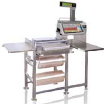
BC-4000L2i pictured with remote scale base and optional wrap station components.