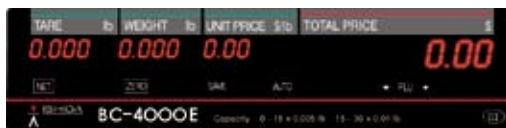
LED, red, numeric: BC-4000E