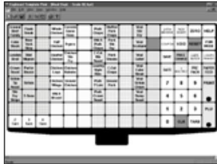
Keysheet print screen