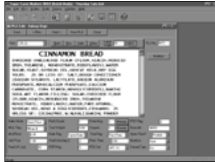
PLU edit screen

Windows is a registered trademark of Microsoft Corporation.