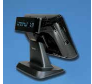
Optional Integrated Rear VFD Customer Display