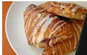
Dusty Environments Like Pizza and Bakeries