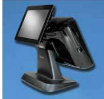
Optional Integrated 9.7" Rear LCD Customer Display