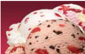
Bars / Ice Cream Parlors / Restaurants