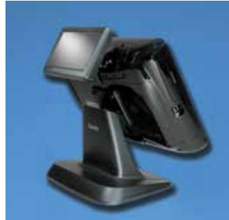
Optional Integrated 7" Rear LCD Customer Display