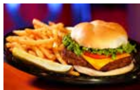
Cafeterias / Table Service / Quick Service