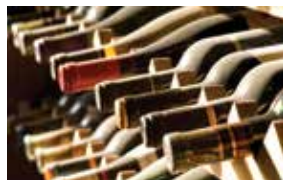
Tobacco Stores / Liquor Stores