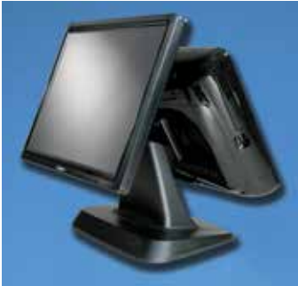
Optional Integrated 15" Rear LCD Customer Display