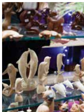
Dollar Stores / Gift Shops